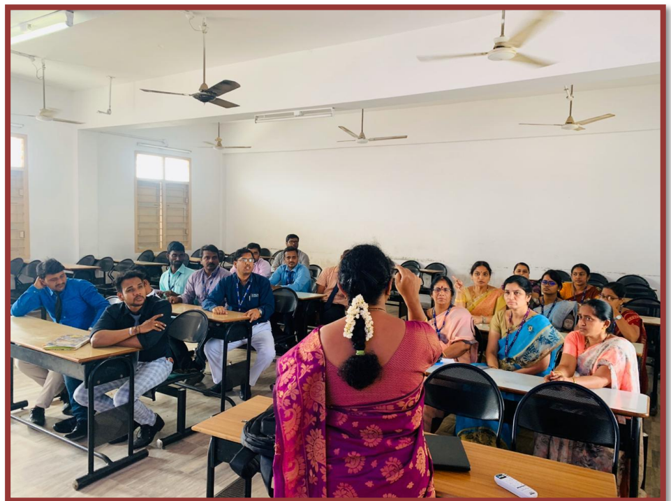
Staff at the Programme