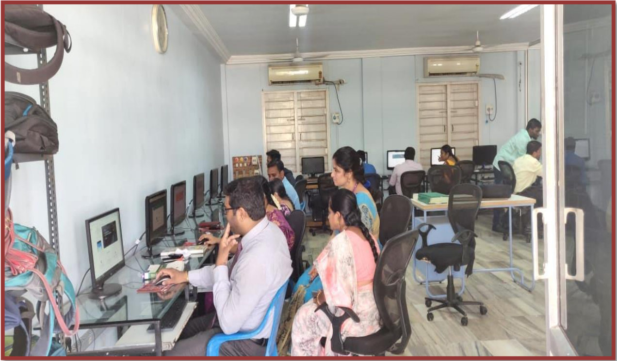
Lab Session to faculty